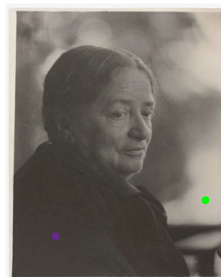
Figure 2. (below) XRF spectra from the Dmax, Dmin, mount, and background signal produced by the analyzer.