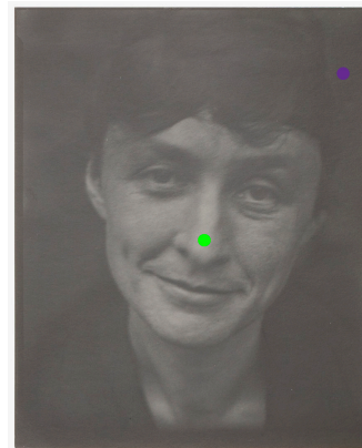
Figure 2. (below) XRF spectra from the Dmax, Dmin, mount, and background signal produced by the analyzer.